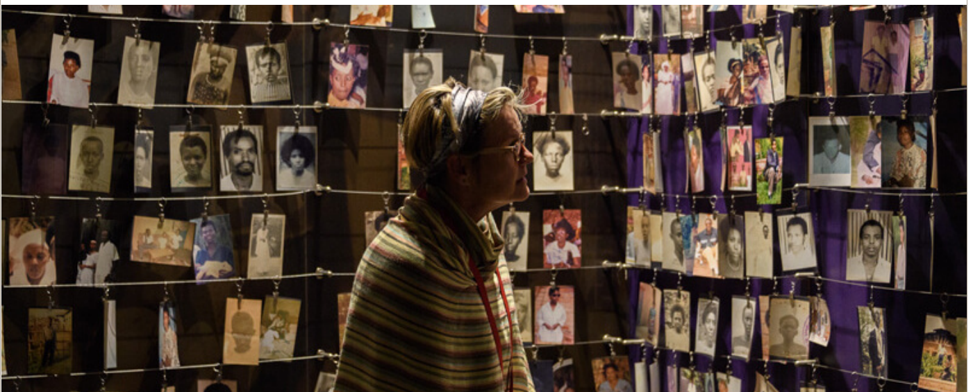
PHOTO CREDIT: RWANDAN DANCERS BY SIMON BELLINGHAM, GENOCIDE MUSEUM