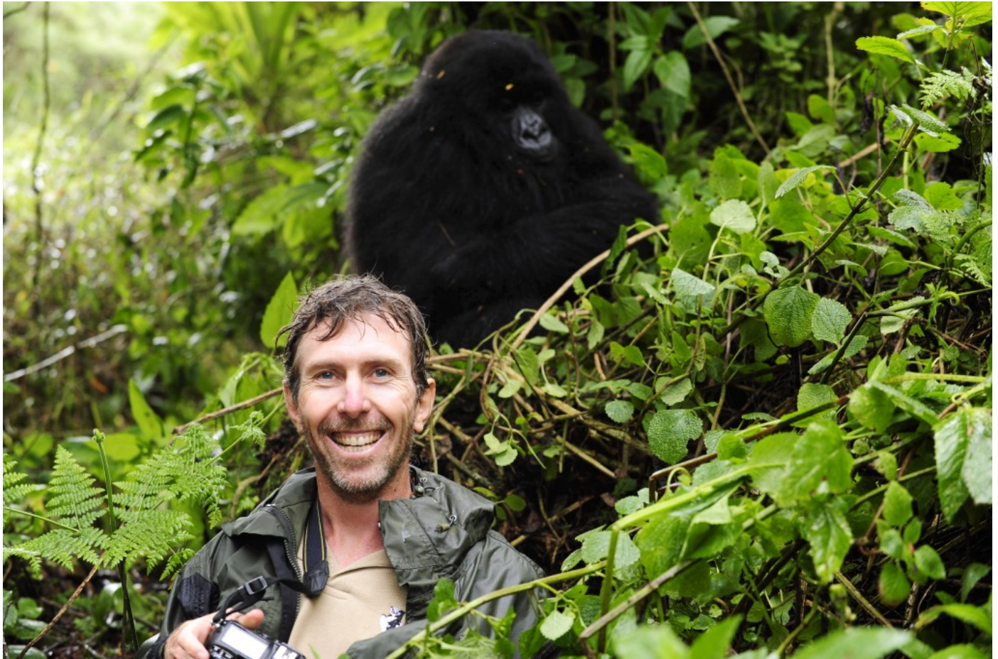
PHOTO CREDIT: GORILLA TREKKING IN VOLCANS NATIONAL PARK BY TREVOR SAVAGE