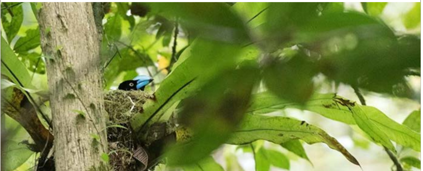
PHOTO CREDIT: RED RUFFED LEMUR AND HELMET VANGA BY SIMON BELLINGHAM