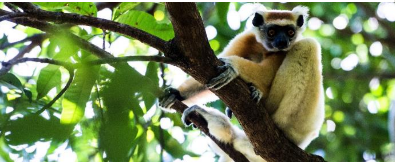
PHOTO CREDIT: OUSTALET'S CHAMELEON AND GOLDEN CROWNED SIFAKA BY TIME + TIDE MIAVANA